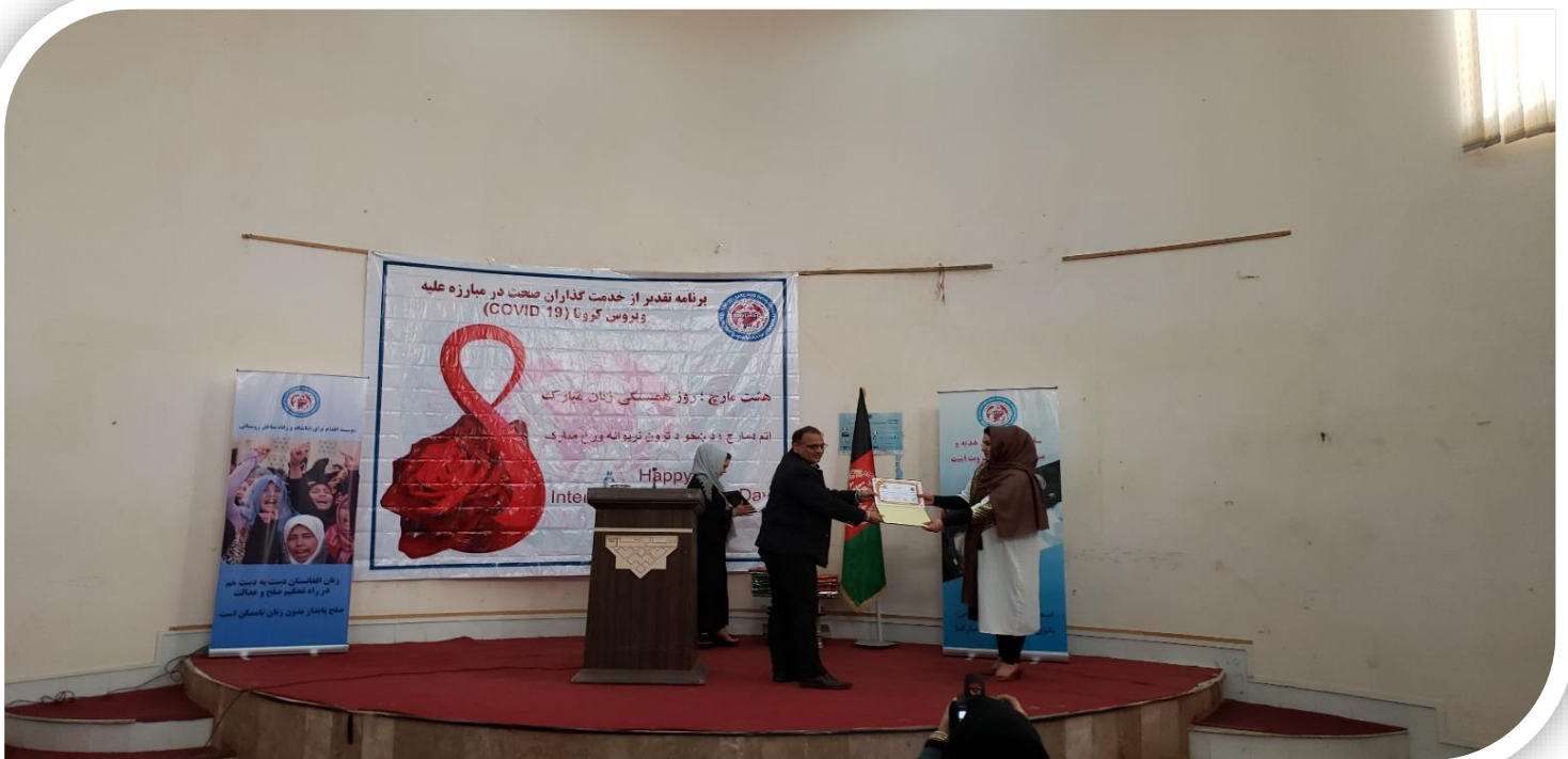
Distribution of Appreciation letter and gift to Doctors who worked in COVID-19